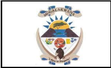
Mogalakwena Locality Map